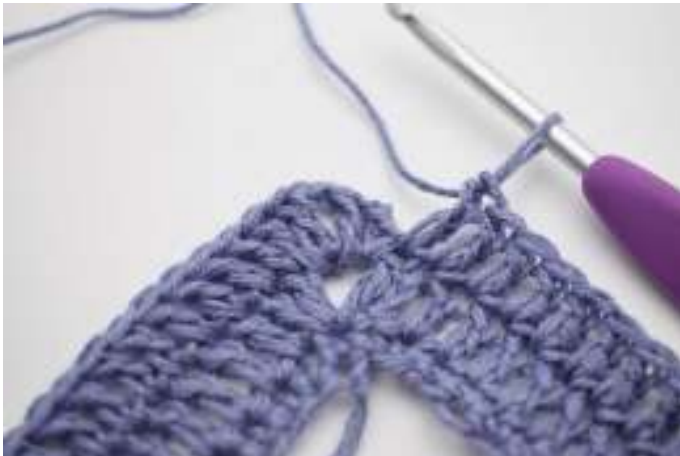
7. dc in the last 67 sts.