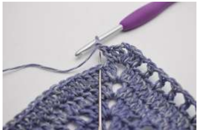
8. *ch 1, skip 1 st.