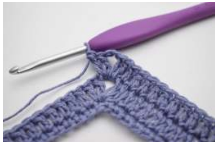
6. Like this.