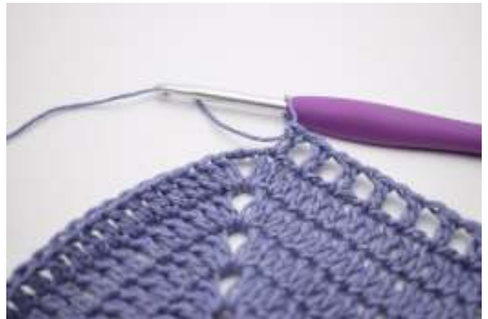
6. Repeat *-* a total of 41 times.