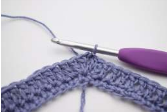
1. sl st to the ch space from the previous round.