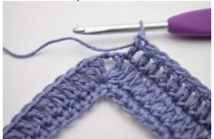
4. dc in the next 67sts.