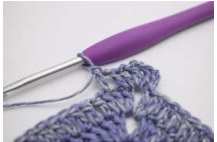
4. dc in the next st.*