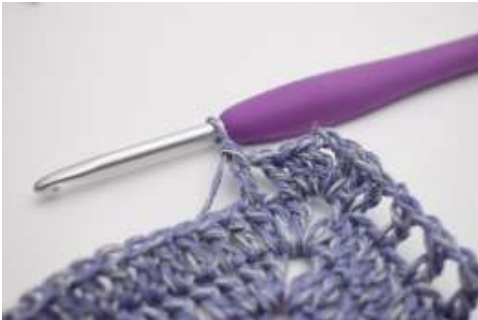
9. dc in the next st.