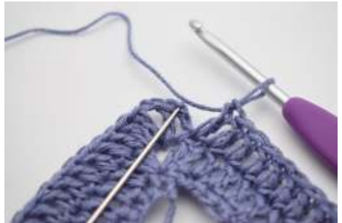
8. End with a sl st.