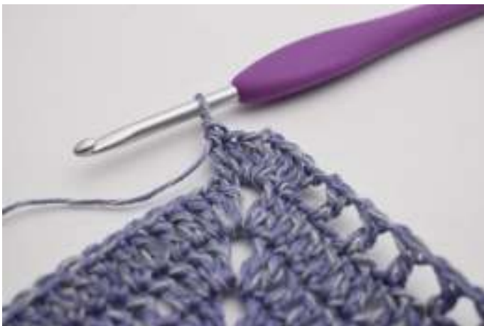
7. dc in the next st