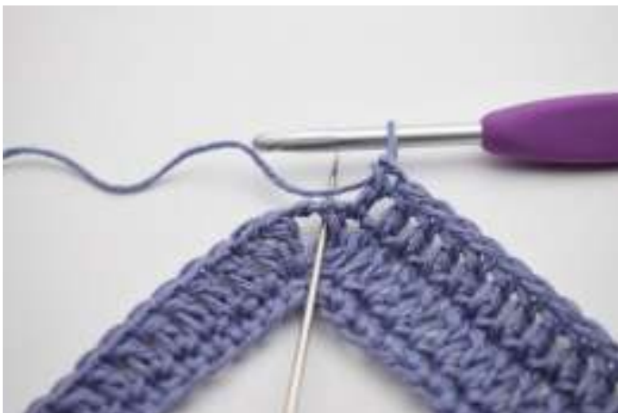
5. 2 dc, ch 2, 2 dc in the next ch 2 space.