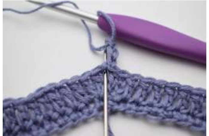
2. Ch 3 (counts as 1 dc). 1 Dc, ch 2 and 2 dc in the same ch- space.