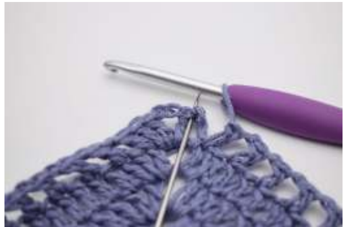
12. End with a sl st.