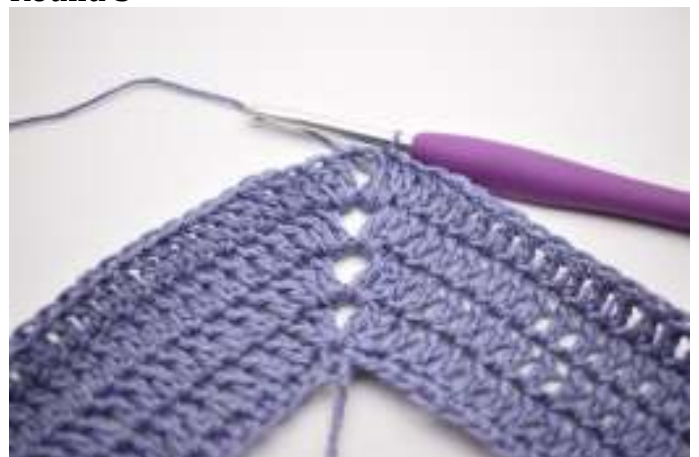
1. sl st to the ch space from the previous round. Ch 3 (counts as 1 dc). 1 Dc, ch 2 and 2 dc in the same ch- space. dc in the next 75 sts. 2 dc, ch 2, 2 dc in the next ch 2 space. dc in the last 75 sts. End with a sl st.