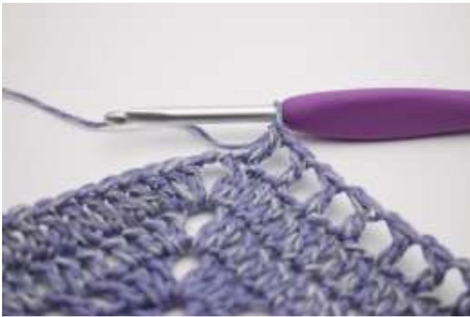
5. Repeat *-* a total of 47 times.