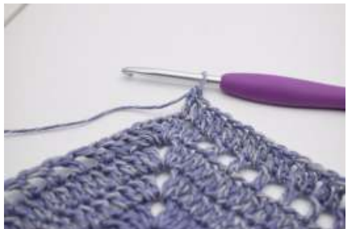
2. dc in the next 99 sts and ch-spaces.