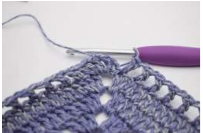
10. Repeat *-* a total of 47 times.