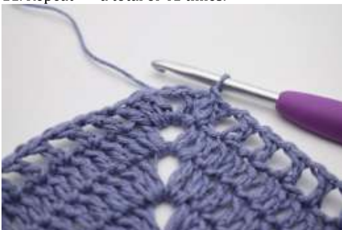
13. Like this.