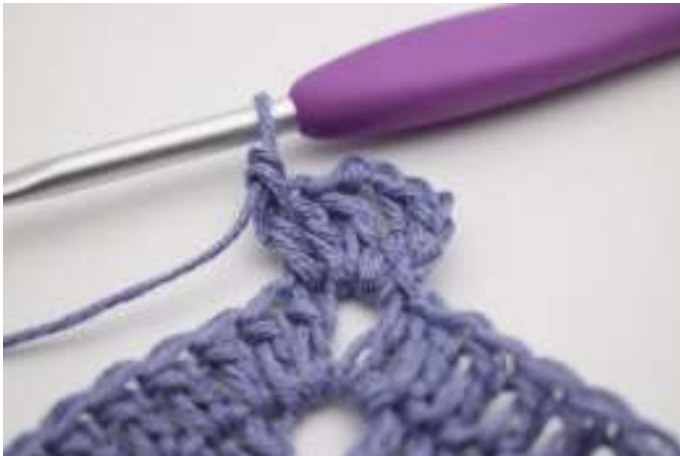
3. dc in the next st