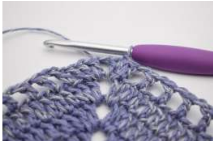
12. Like this.