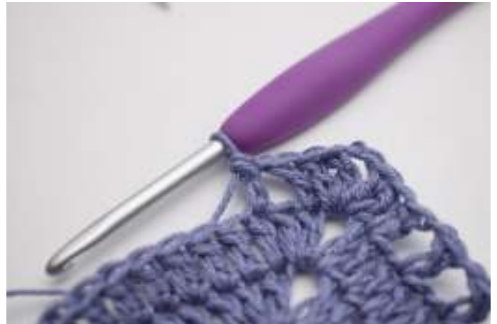
10. dc in the next st.*