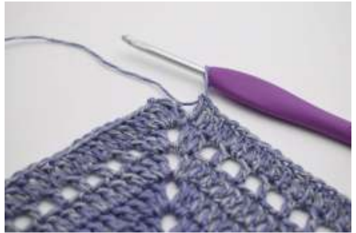
4. dc in the last 99 sts and ch-spaces.