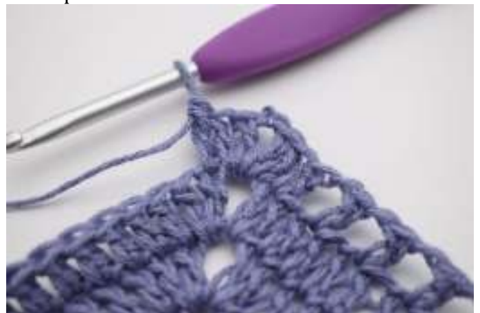
8. dc in the next st.