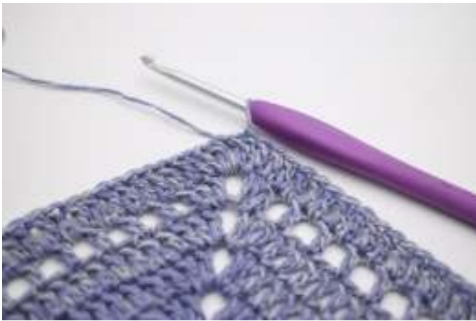
5. End with a sl st.