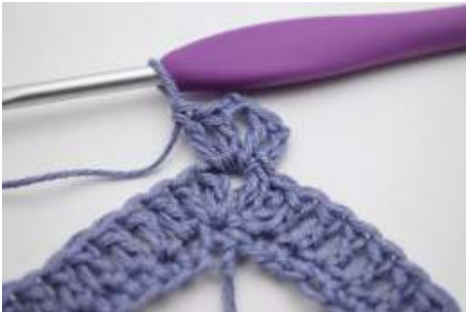
3. Like this.