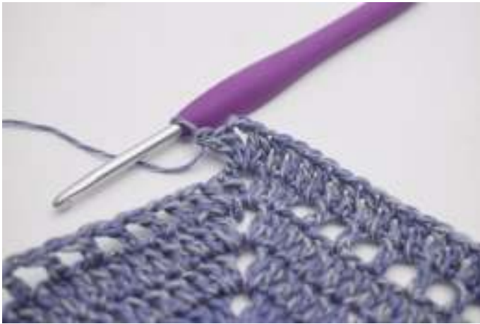
3. 2 dc, ch 2, 2 dc in the next ch 2 space.