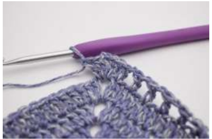
6. 2 dc, ch 2, 2 dc in the next ch 2 space.