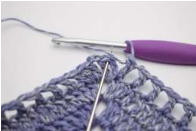
11. End with a sl st