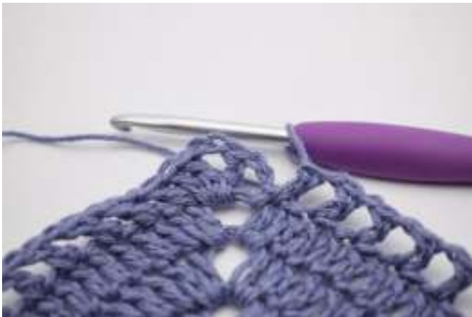
11. Repeat *-* a total of 41 times.