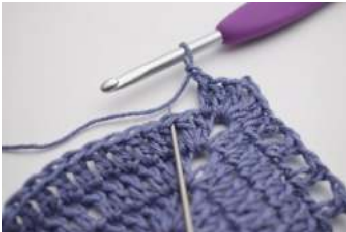
9. *ch 1, skip 1 st,