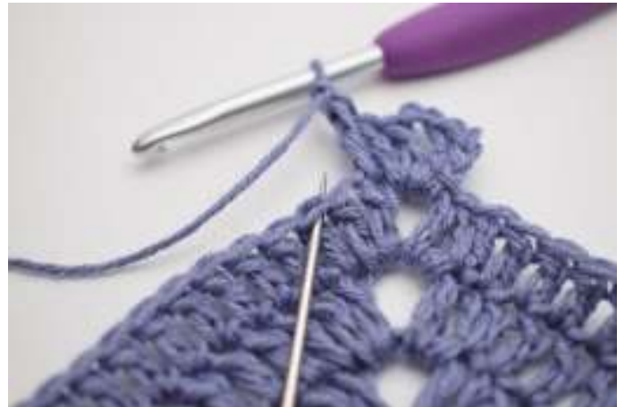
4. *ch 1, skip 1 st,