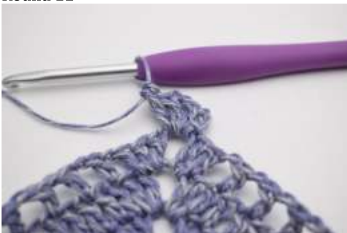
1. sl st to the ch space from the previous round. Ch 3 (counts as 1 dc). 1 Dc, ch 2 and 2 dc in the same ch- space.