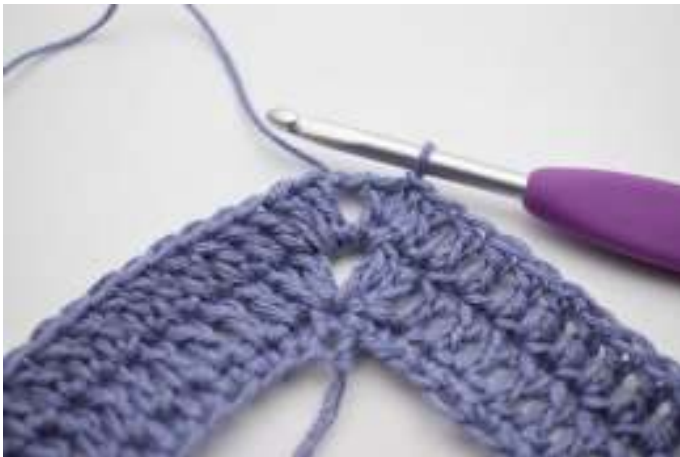
9. Like this.