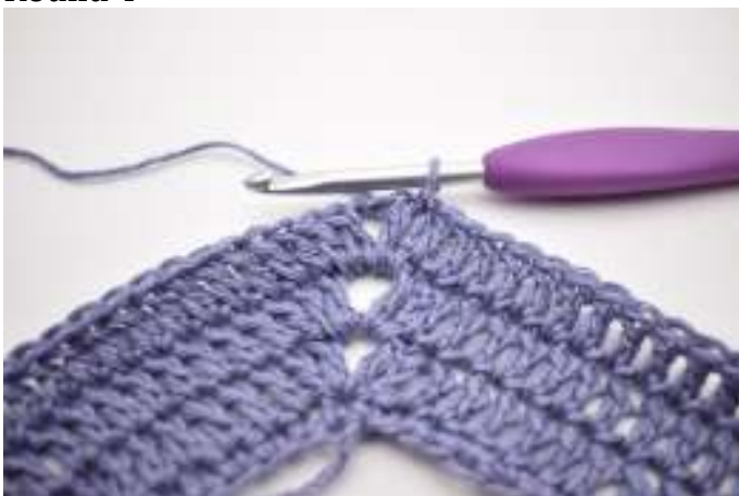
1. sl st to the ch space from the previous round. Ch 3 (counts as 1 dc). 1 Dc, ch 2 and 2 dc in the same ch- space. dc in the next 71 sts. 2 dc, ch 2, 2 dc in the next ch 2 space. dc in the last 71sts. End with a sl st.