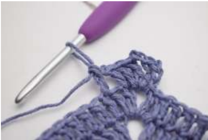
5. dc in the next st*