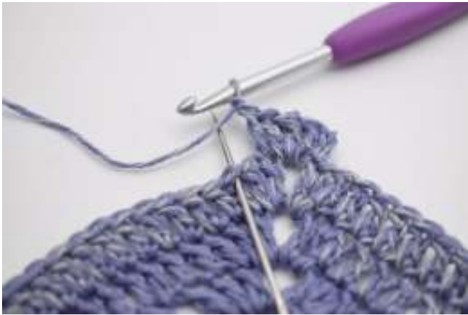
3. *ch 1, skip 1 st.