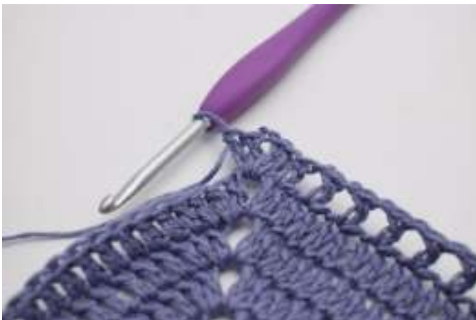
7. 2 dc, ch 2, 2 dc in the next ch 2 space.