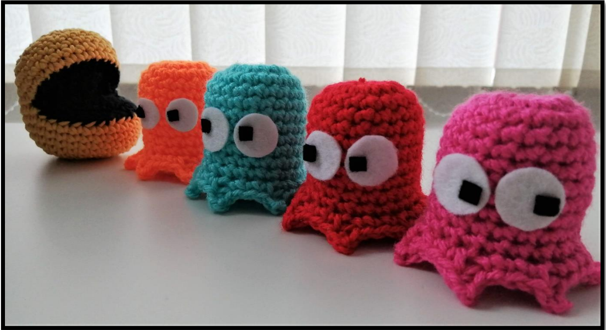
Pinky (pink), Clyde (orange), Inky, (blue) and Blinky (red).